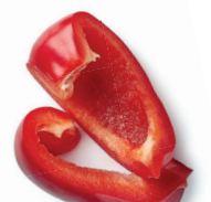
■ Segments 2 to 24 pieces