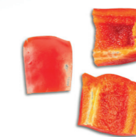
■ Shashlik cubes measuring 25 and 30 mm