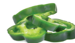
■ Rings up to 2 pieces